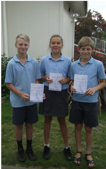
Winning House - Liston