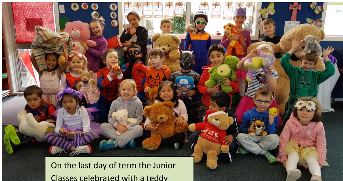
On the last day of term the Junior Classes celebrated with a teddy bears picnic