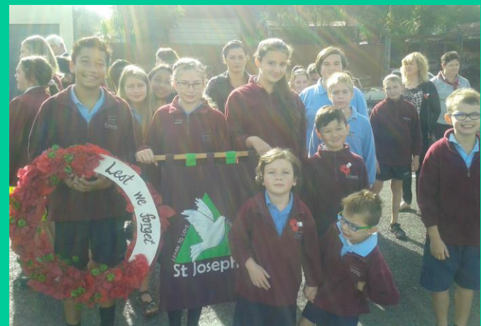
Thankyou to all the children and parents that took part in the ANZAC ceremony last Thursday. The children marched in the parade with the school banner and lay a reef made by room 4.