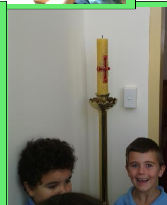
Room 3 visited the reconciliation room at the Church as part of the Sacrament strand. They also visited the choir loft and sang "This little light of mine"