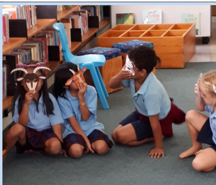
The juniors had lots of fun acting out the "Three Billy Goats Gruff", in groups.