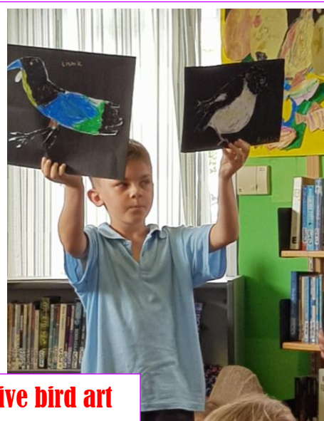
Room 3 native bird art

Friday 14 December - Tiny wheels- (toy cars, trucks, etc)