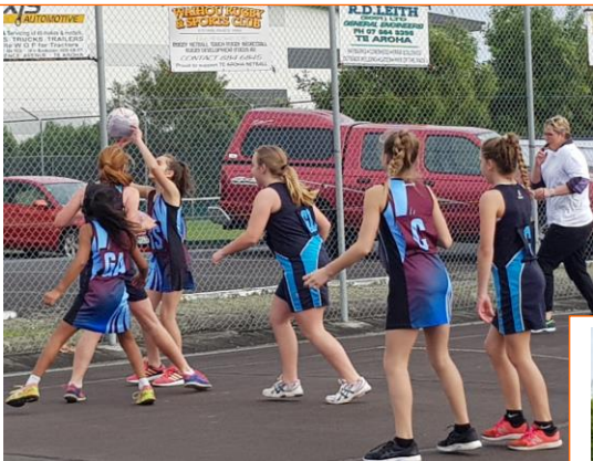
Winter sports underway last Saturday a cold morning.