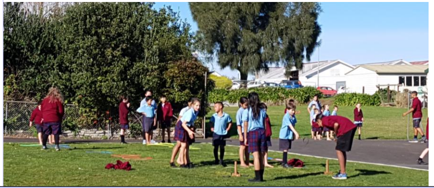
Tabloids Sports Friday Afternoon