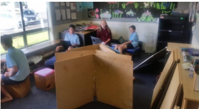
Room 5 Puawai working hard on their Science Fair projects.