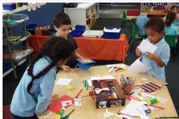
The junior school are buzzy bees making Mother's Day gifts.