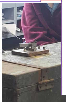
This week, Madison's mum visited our class with different special artifacts which were used or bought back from WW1 and WW2. This linked directly to our ANZAC Day learning. Thank you for sharing your family history with us!