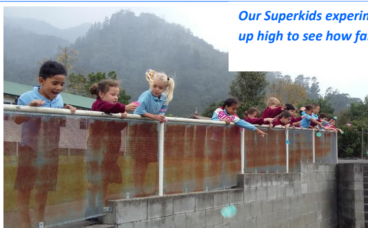
Our Superkids experimenting with 'flight'. We dropped our umbrellas from up high to see how far they would travel using gravity and wind.